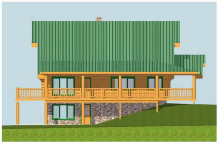
RIGHT ELEVATION VIEW