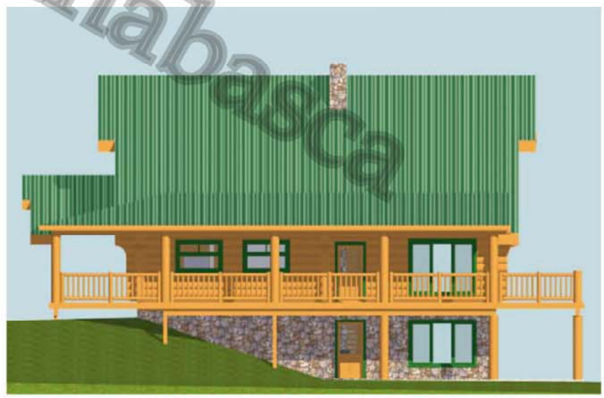
LEFT ELEVATION VIEW.tif