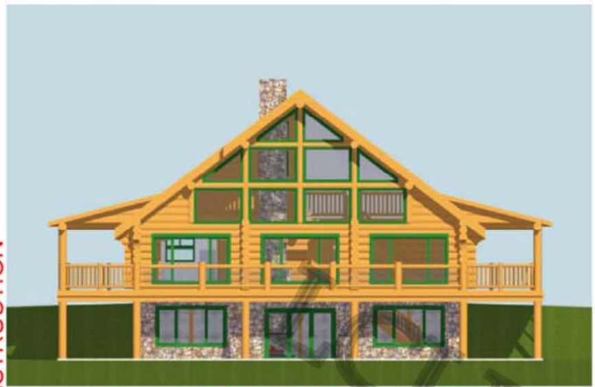
FRONT ELEVATION VIEW.tif